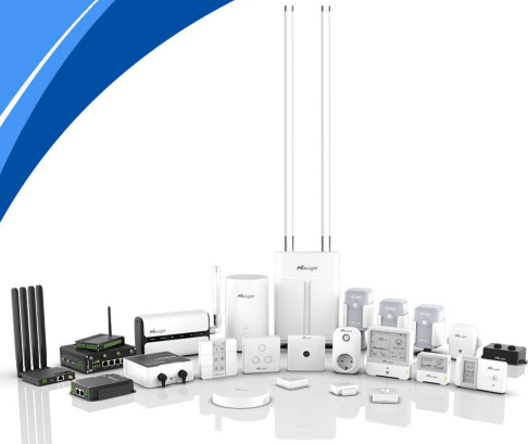
Milesight IoT Product Portfolio