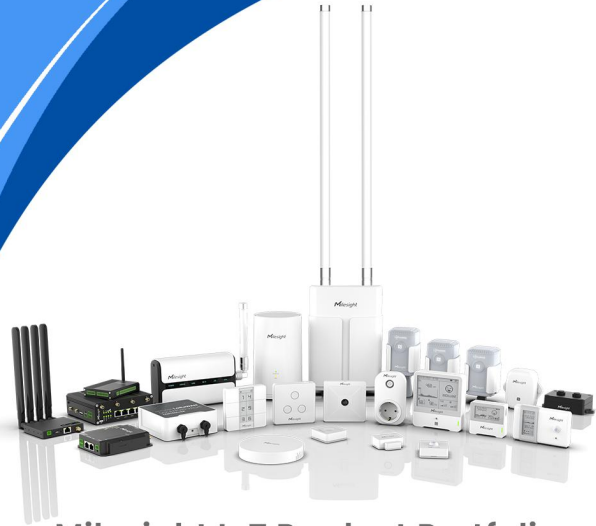
Milesight IoT Product Portfolio